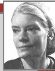
Portrait of Dorothy, c. 1938

"The greatest challenge of the day is: how to bring about a revolution of the heart, a revolution which has to start with each one of