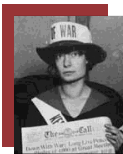
Dorothy Day, February 1917.