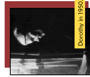
Dorothy in 1950.

Submit the petition for which you desire prayers through the intercession of Dorothy Day. Please type or print clearly.